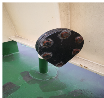
Hydrant connection type DN50, PN16.