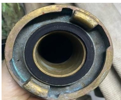
Hydrant connection type Storz 2.

Fresh water delivery is available by several tugs. Please note that we supply TECHNICAL WATER only. Please see details in chapter 5 “Tug specification”.